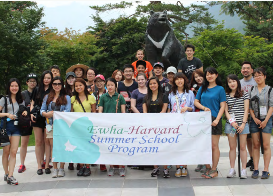
Photo: Field Trip at Seorak Mountain National Park

Co-hosted by Ewha Graduate School of International Studies and Harvard University, the annual Ewha-Harvard Summer School was held from June 23 to August 1. The program has been running since 2006 and was designed to develop global perspective while studying Korean history and culture at Ewha. On average, around 10 Harvard students visit Ewha for this program each year, which is reflective of university’s renowned research competence. In 2014, 7 Harvard students and 16 Ewha students attended this program under the theme of “Cinema Korea: Documenting Korean Society through Film”.