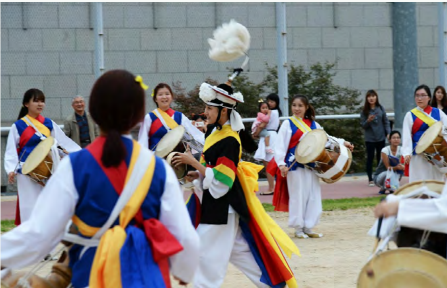
Photo: (left) Bibimbap Mixing Event (right) Korean Traditional Percussion Quartet