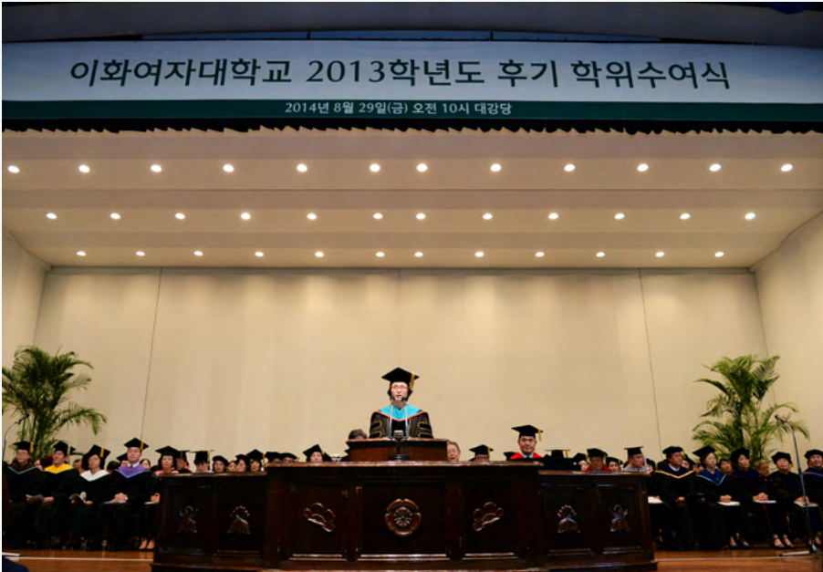
Photo: Welch-Ryang Auditorium

On August 19, Commencement Ceremony took place in Welch-Ryang Auditorium. A sum of 1,841 undergraduates received their degrees on this day. This event was streamed live and shared on Ewha YouTube channel ( http://www.youtube.com/user/ewhauniv ), for students and families who could not attend. Commencement takes twice a year, in spring and winter. So far, Ewha produced 158,802 undergraduates, 40,648 graduates, and 3,196 Ph.D. students. This spring, 2,243 students received their bachelor’s degrees.