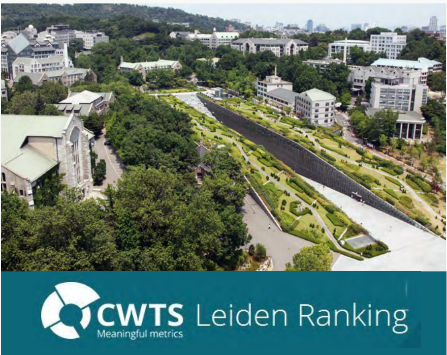
Photo: Ewha Campus and the logo of CWTS Leiden Ranking

For two consecutive years, Ewha has ranked #1 among universities in Korea. This is a meaningful reflection of committed effort on research and education from Ewha faculty and students altogether. Leiden Ranking measures the scientific performance of 750 major universities worldwide using bibliometric indicators every year. It is regarded as a more objective and advanced indicator than many other rankings. It concentrates on scientific performance by measuring universities’ research citation scores without relying on highly subjective data such as reputation surveys.