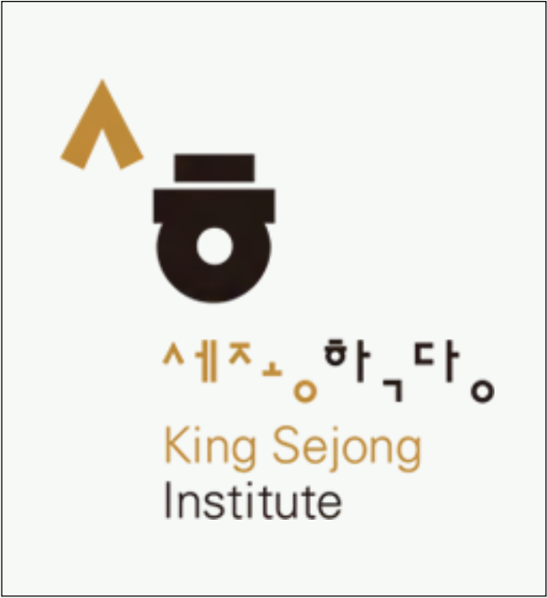
Photo: The Logo of King Sejong Institute

King Sejong Institute was founded by the Korean government in order to support the propagation of Korean language and cultures across the globe. With President’s instruction of ‘direction for strengthening Hangul (Korean language)’s international competitiveness’ in 2008, the foundation has since expanded into 130 institutes over 54 countries. Ewha plans to deepen collaboration with other institutes regarding proliferation of Hangul , supporting provision of K-culture in the world.