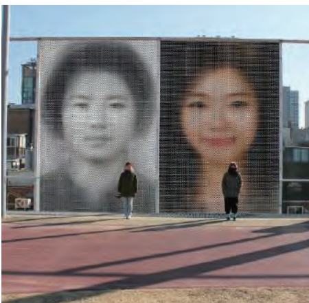
Face collage from 130 photos of Ewha students in the 20th century (left) and 21st century (right)

‘ARTFESTA EWHA’ consisted of 5 projects: Ewha Craft&Art Fair, Design 52, Pop-up Container Project, Public Art Project, Ewha Media Art Presentation. During Artfesta Ewha, the entire campus was packed with media art exhibitions under the themes of art and history, art and technology, and art and nature.